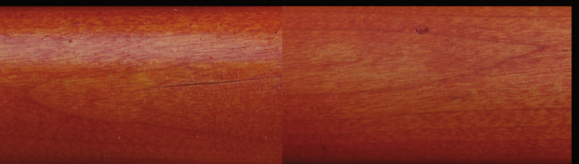
NAVAJO RED TF-601