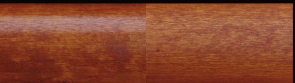
DARK WALNUT TF-603

TOPCOATED WITH EXTERIOR CLEARS GLOSS TF-500GL SATIN TF-500SA