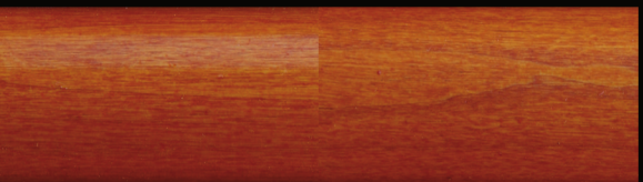
SEQUOIA RED TF-504