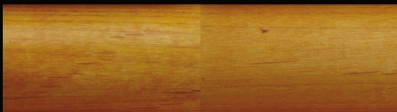
NATURAL REDWOOD TF-503