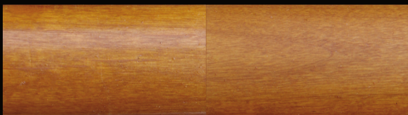
OAK BROWN TF-604

TOPCOATED WITH EXTERIOR CLEARS GLOSS TF-500GL SATIN TF-500SA