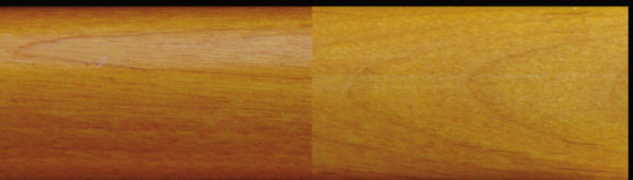
NATURAL CEDAR TF-502

TOPCOATED WITH EXTERIOR CLEARS GLOSS TF-500GL SATIN TF-500SA