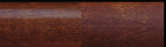
OXFORD BROWN TF-602