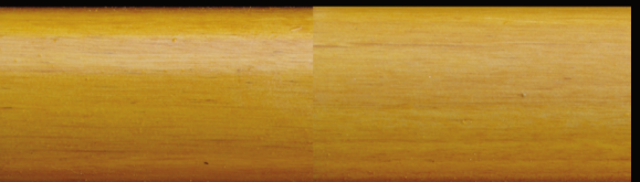
NATURAL PINE / FIR TF-501

TOPCOATED WITH EXTERIOR CLEARS GLOSS TF-500GL SATIN TF-500SA